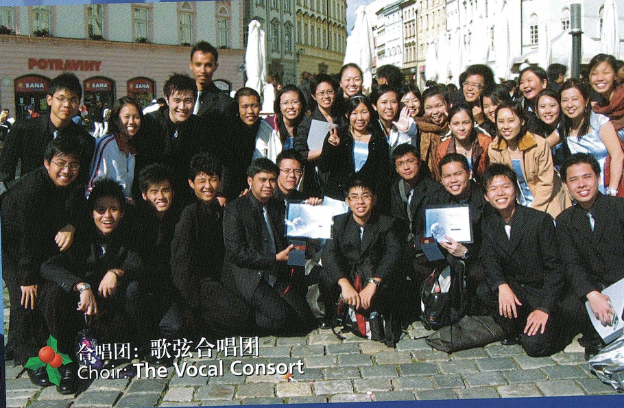
合唱团: 歌弦合唱团 Choir: The Vocal Consort